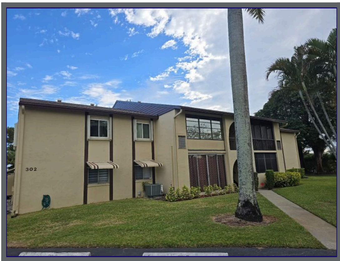
302 PINE RIDGE CIRCLE GREEN ACRES FL 33463