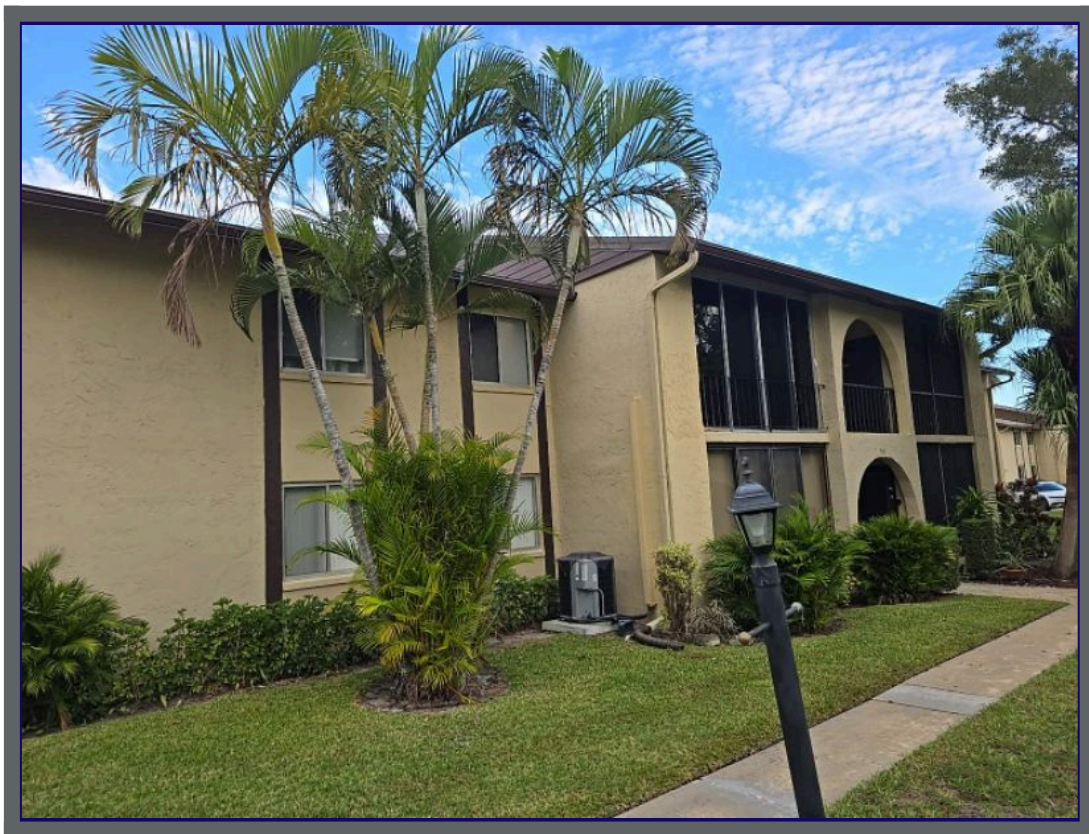
301 PINE RIDGE CIRCLE GREEN ACRES FL 33463