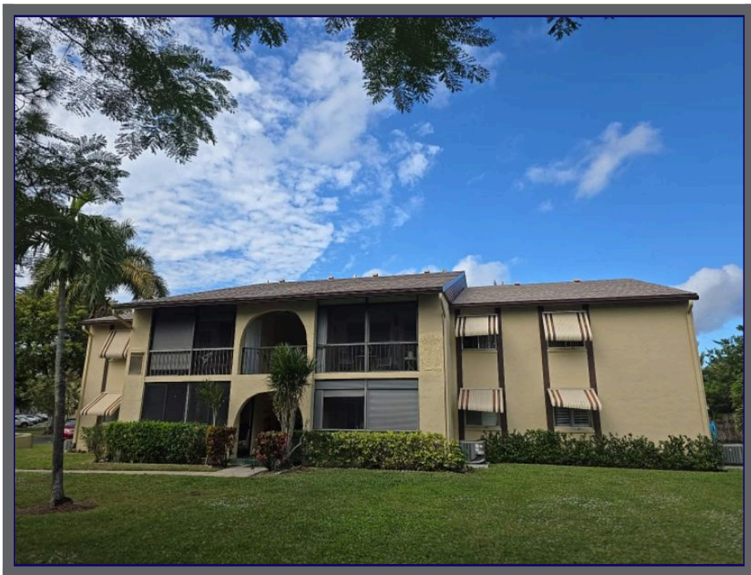
323 PINE RIDGE CIRCLE GREEN ACRES FL 33463