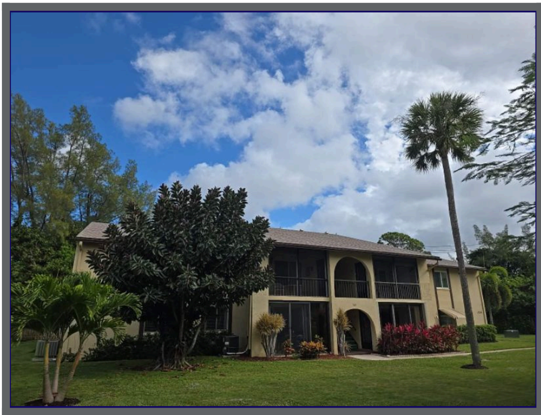
324 PINE RIDGE CIRCLE GREEN ACRES FL 33463