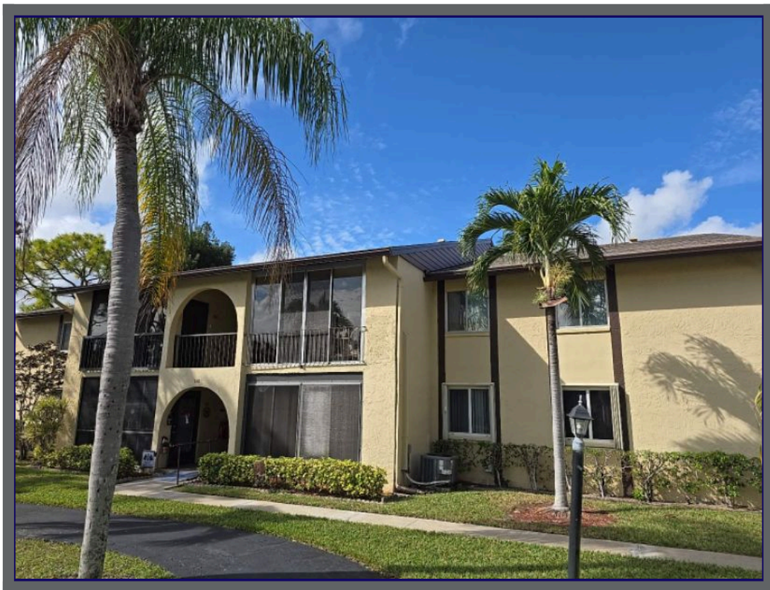
340 PINE RIDGE CIRCLE GREEN ACRES FL 33463