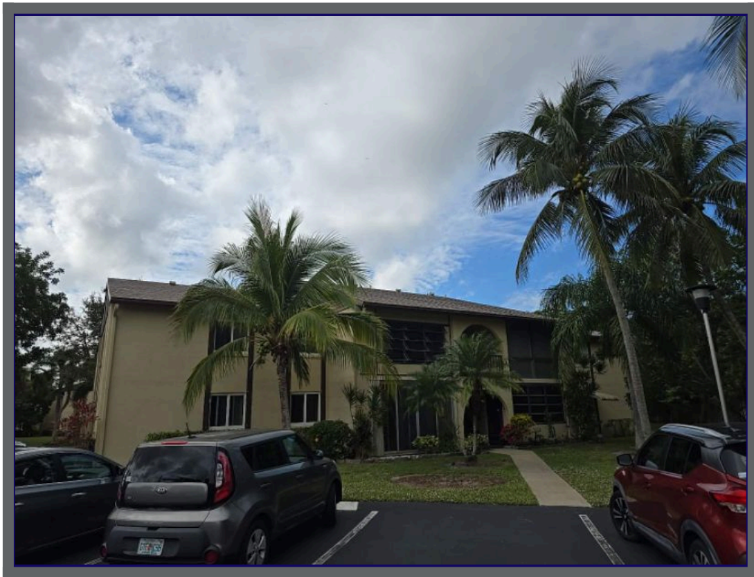
329 PINE RIDGE CIRCLE GREEN ACRES FL 33463