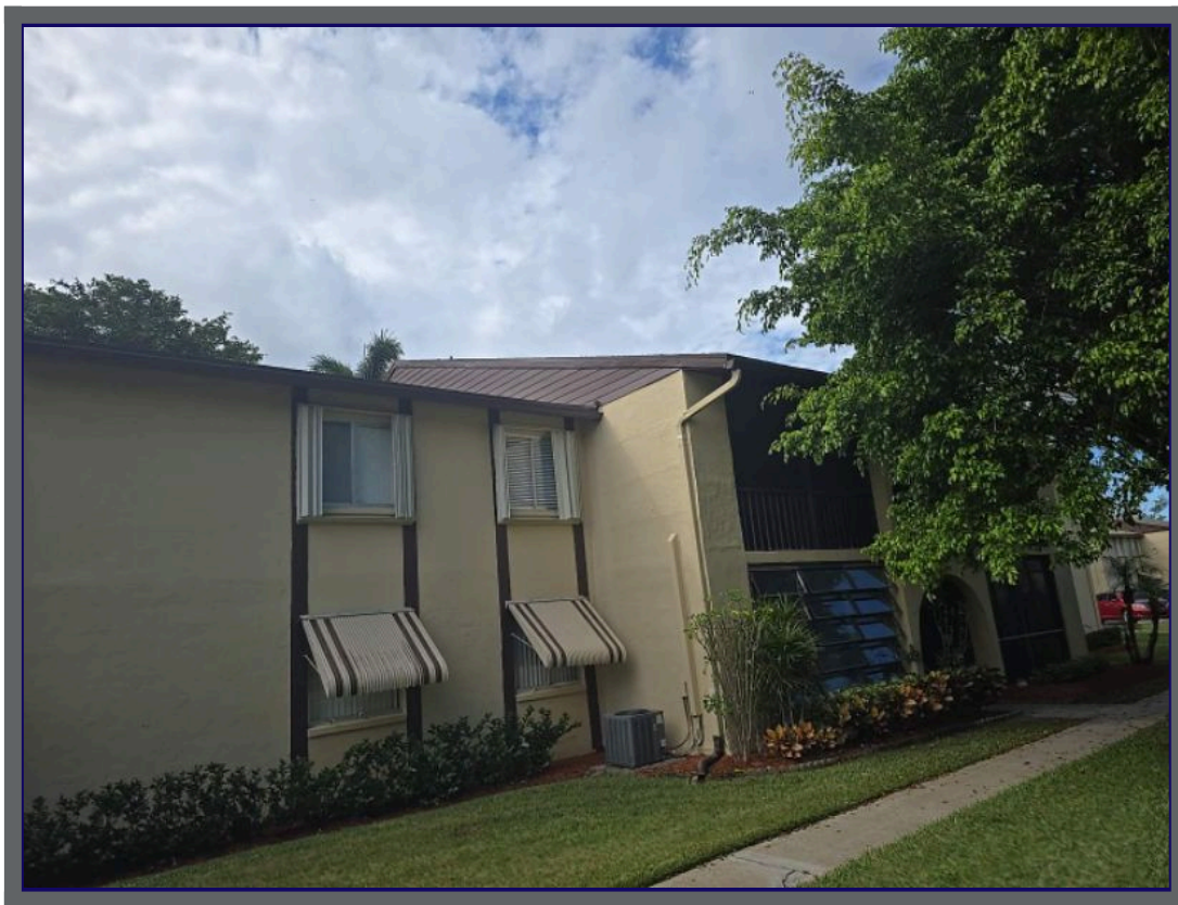
321 PINE RIDGE CIRCLE GREEN ACRES FL 33463