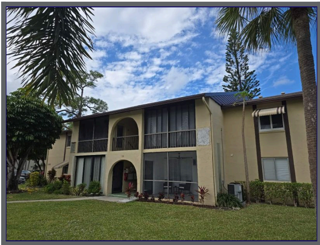
326 PINE RIDGE CIRCLE GREEN ACRES FL 33463