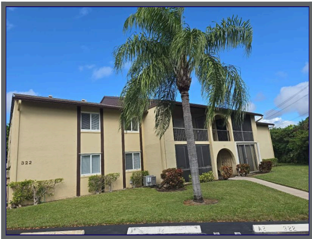
322 PINE RIDGE CIRCLE GREEN ACRES FL 33463