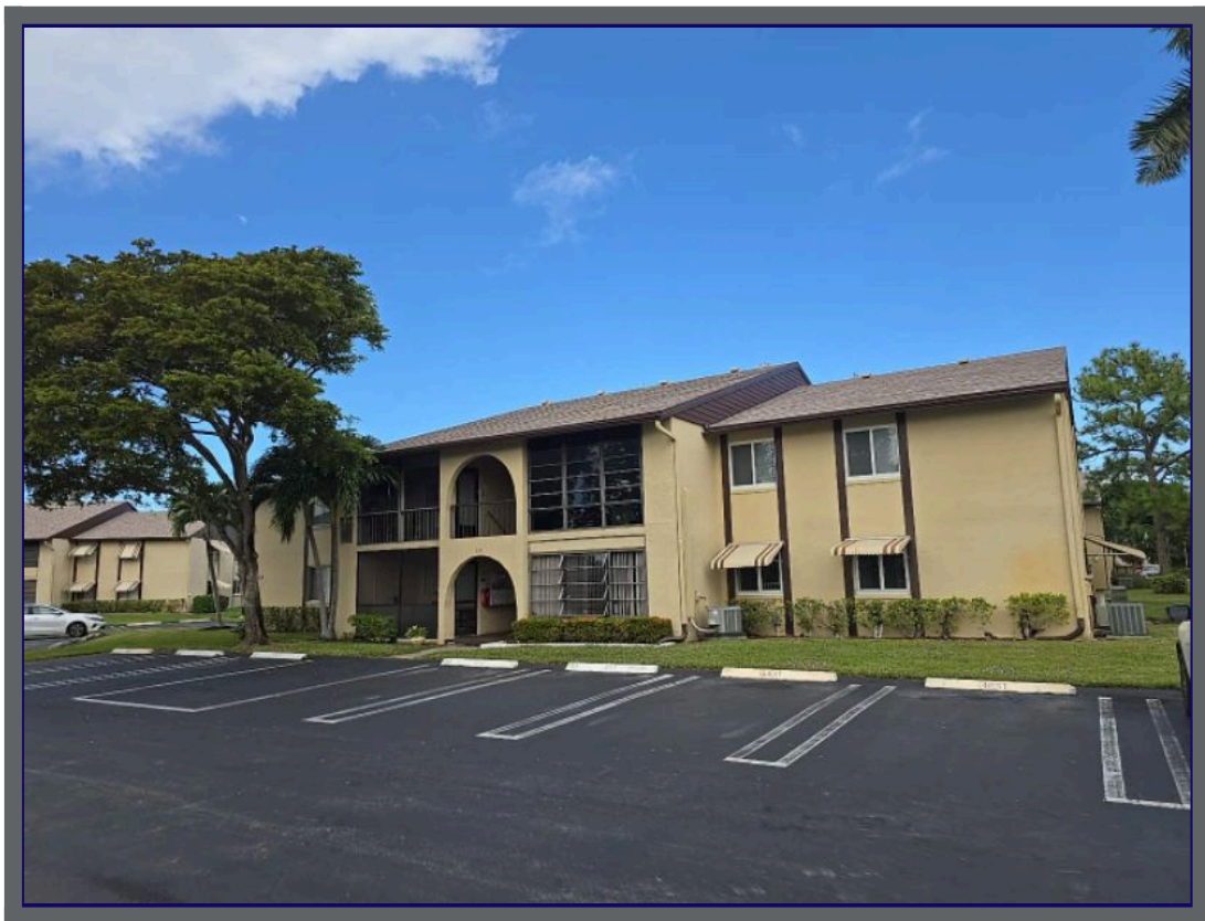
317 PINE RIDGE CIRCLE GREEN ACRES FL 33463