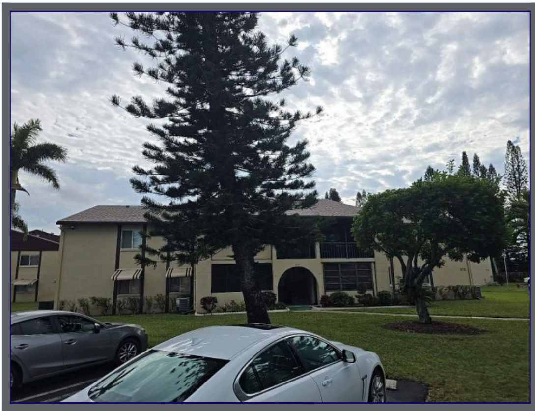
313 PINE RIDGE CIRCLE GREEN ACRES FL 33463