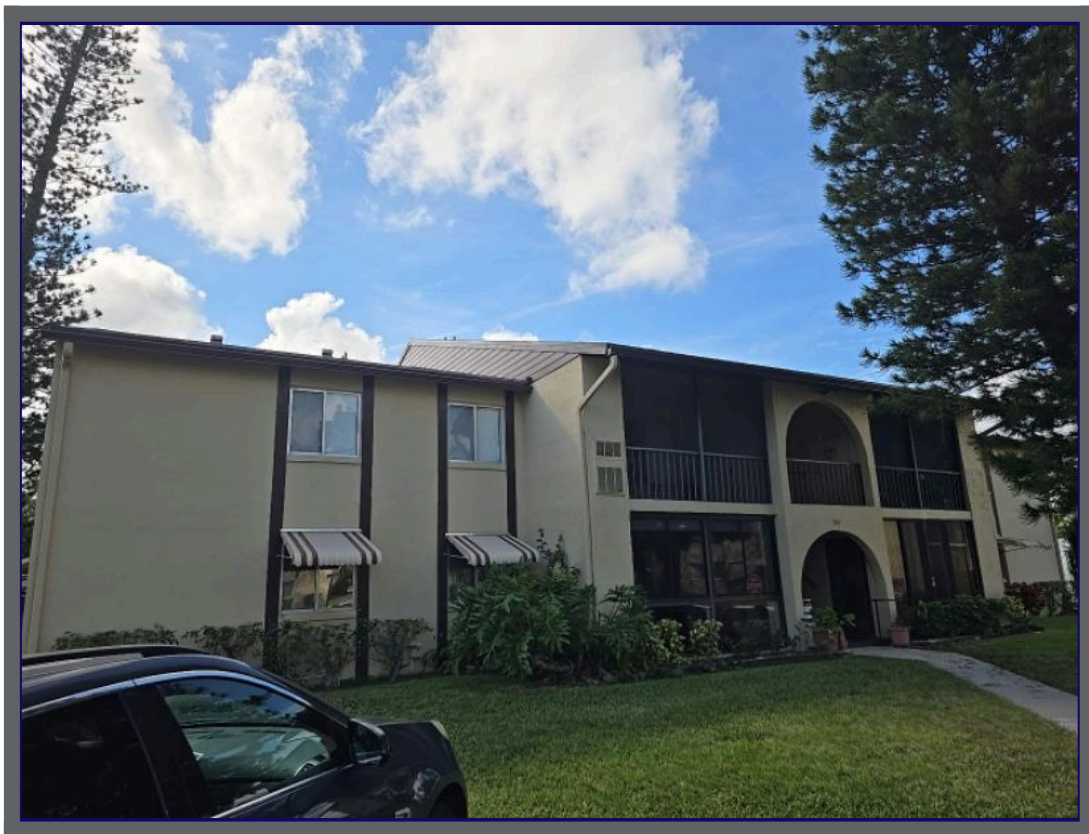
341 PINE RIDGE CIRCLE GREEN ACRES FL 33463