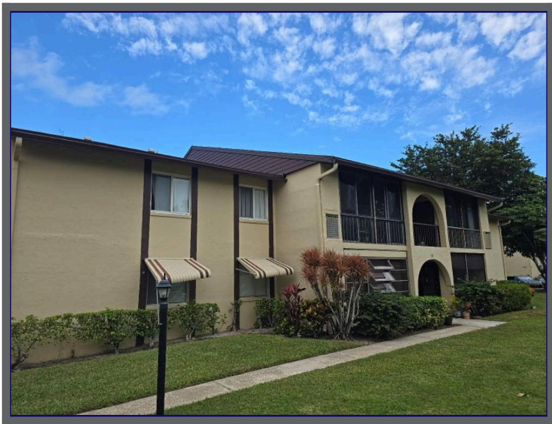
305 PINE RIDGE CIRCLE GREEN ACRES FL 33463