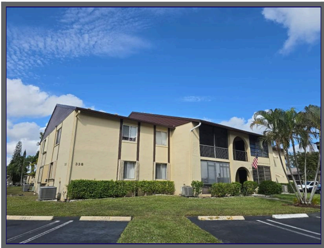
338 PINE RIDGE CIRCLE GREEN ACRES FL 33463