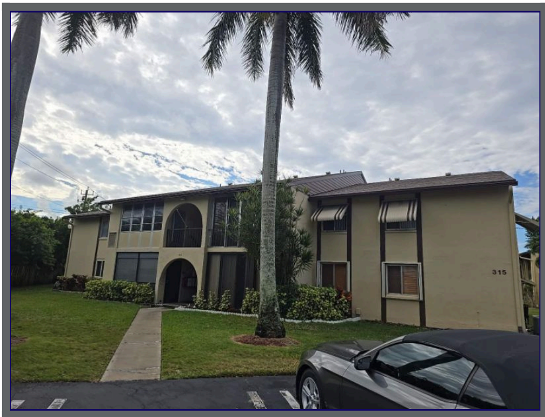
315 PINE RIDGE CIRCLE GREEN ACRES FL 33463