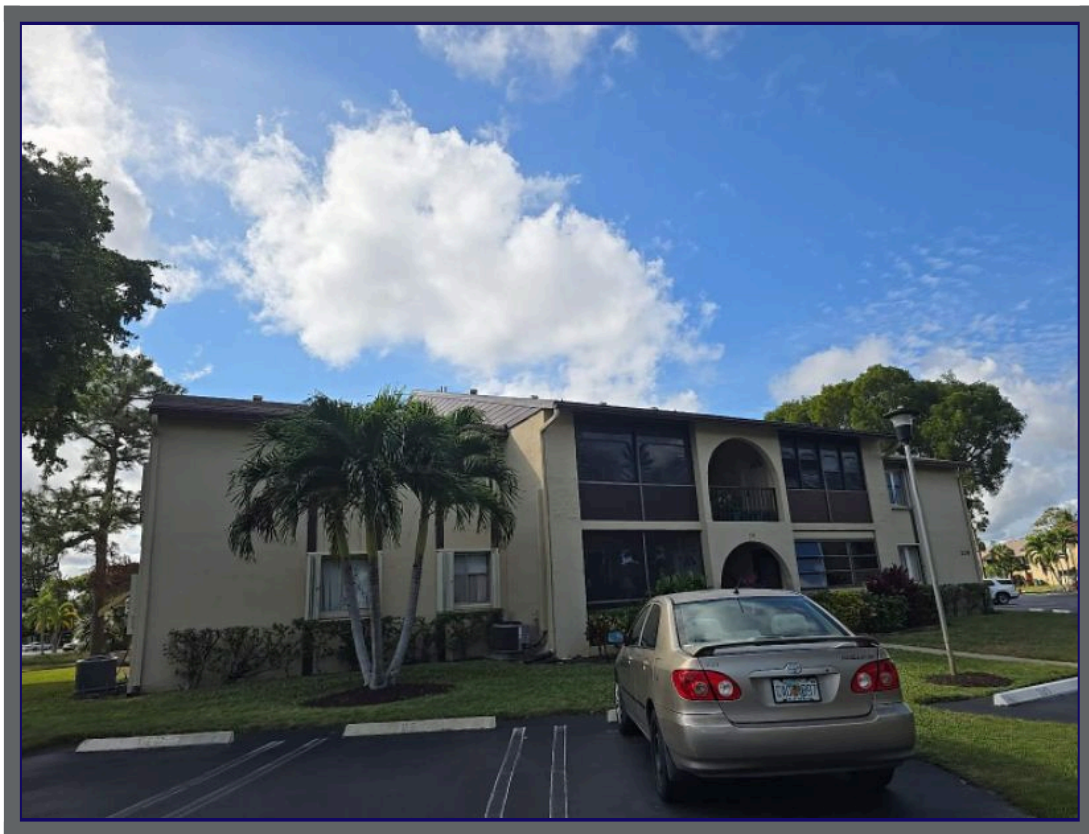
339 PINE RIDGE CIRCLE GREEN ACRES FL 33463