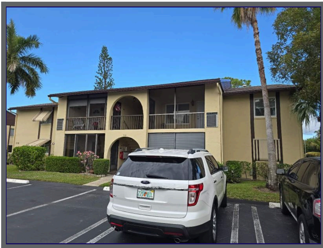
318 PINE RIDGE CIRCLE GREEN ACRES FL 33463