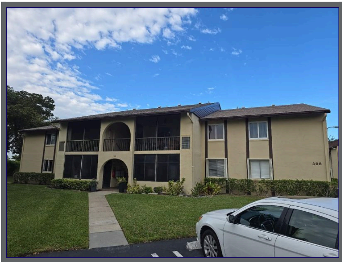
308 PINE RIDGE CIRCLE GREEN ACRES FL 33463